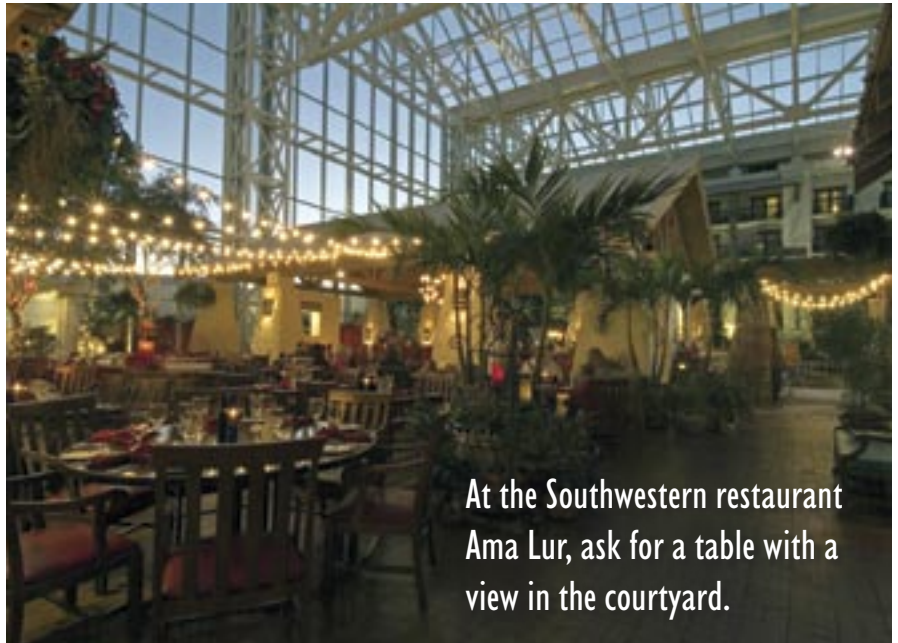
At the Southwestern restaurant Ama Lur, ask for a table with a view in the courtyard.

To get the full club experience, splurge for the VIP package. At $130, it's not the least expensive golf you'll play, but it's a nice splurge. When you check in, you're given a magnetized ball marker with the Cowboys' logo that you wear on your shirt or hat. In addition to your green fee and cart fee, it entitles you to range balls, as well as complimentary non-alcoholic beverages and food service throughout the day, in the clubhouse and on the golf course. For more budget-minded golfers, Cowboys offers a Player Development Program for $79 a month that includes weekly clinics, unlimited use of the practice facility and twilight golf for only $18.