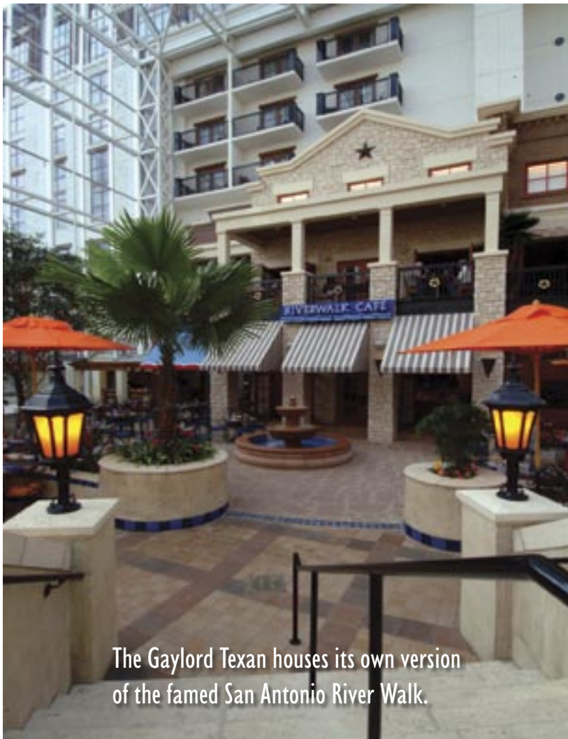
The Gaylord Texan houses its own version of the famed San Antonio River Walk.

Stay and play at the Gaylord Texan and nearby Cowboys Golf Club.